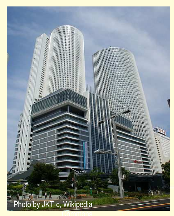
Nagoya Station in Japan, one of the world's largest train station and mulitmodal transport hubs