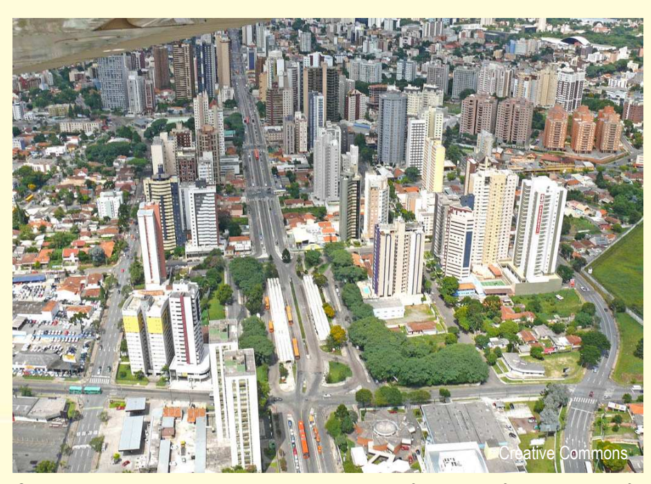
Curitiba, Brazil has long provided a global model for successful integration of transportation and land use planning, with a focus on environmental preservation